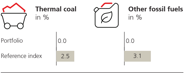
Low estimation uncertainty<sup>1</sup>

There is scientific consensus of the need to phase-out coal and stop financing new fossil fuel projects. Below figures show the share of investments into companies that earn more than 5% of their revenues from such business activities. Share of investments into companies with activities in: