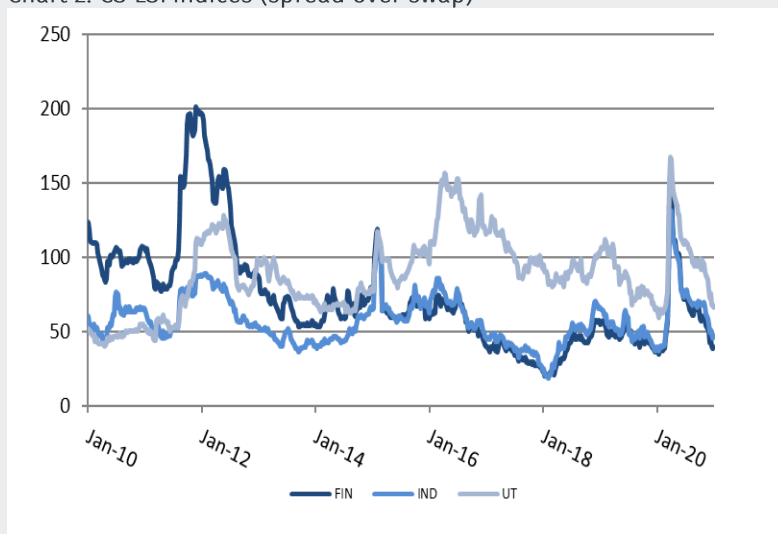
Chart 2: CS LSI Indices (spread over swap)

In this mixed context of uncertainties and positive news we maintain a cautious approach but will be ready to gradually position the fund for the recovery. "Yield-enhancement", "and "spreads compression" are likely to be the key themes in the first quarter. Preference for green bonds will reflect the new trend arising in the market.