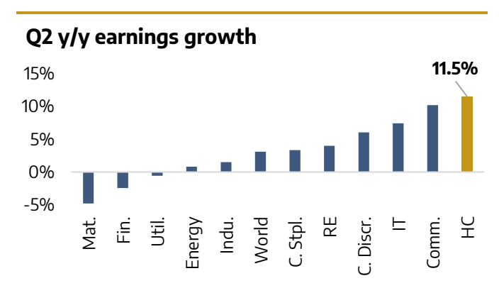
Chart of the Month

Healthcare posted year-over-year earnings growth of 11.8%, the highest rate of all sectors. This growth surpasses even strong performers like Communication Services at 10.2% and IT at 9.8%.