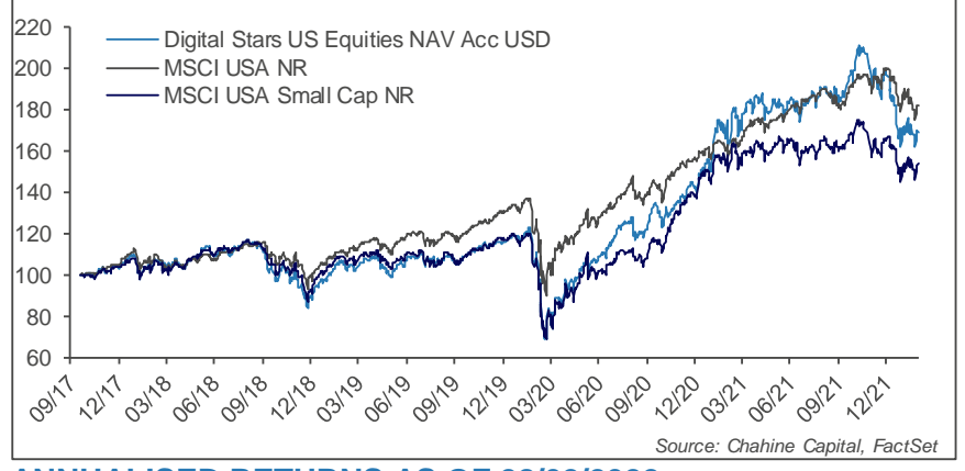
ANNUALISED RETURNS AS OF 28/02/2022