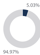
Top 10 Holdings as % of Total

Top 10 holdings as a percentage of Total Net Assets. Portfolio Holdings are subject to change at any time. References to specific securities should not be construed as a recommendation to buy or sell and should not be assumed profitable.