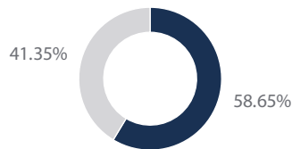
Top 10 Holdings as % of Total

Top 10 holdings as a percentage of Total Net Assets. Portfolio Holdings are subject to change at any time. References to specific securities should not be construed as a recommendation to buy or sell and should not be assumed profitable.