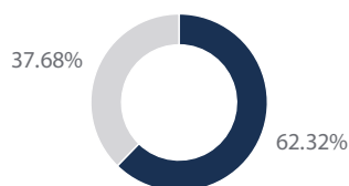
Top 10 Holdings as % of Total

Top 10 holdings as a percentage of Total Net Assets. Portfolio Holdings are subject to change at any time. References to specific securities should not be construed as a recommendation to buy or sell and should not be assumed profitable.