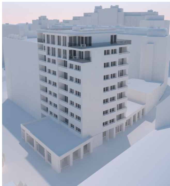
Rue de Lyon 55

At 31.03.2024, the building had a market value of CHF 25.07 million, a cost price of CHF 21.59 million and rental income of CHF 0.88 million.