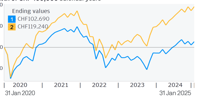
Calendar Year Performance (%)