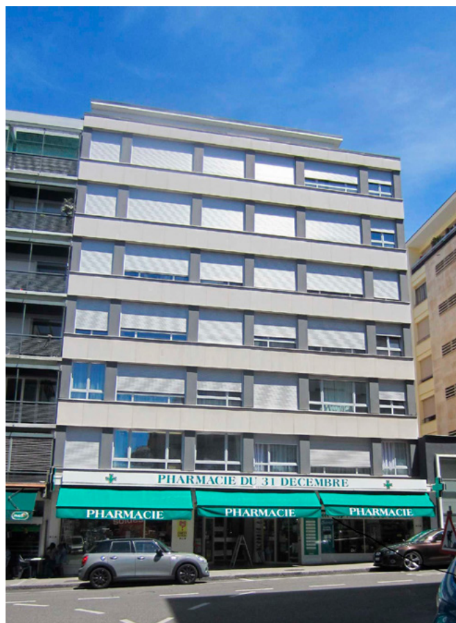
Rue 31 Décembre 43

At 31.03.2024, the building had a market value of CHF 14.66 million, a cost price of CHF 10.21 million and a rental income of CHF 0.50 million. The building's rental reserve is estimated at around 24%.