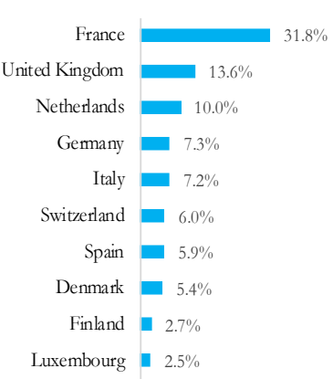
asset breakdown and top holdings as of August 31st 2023