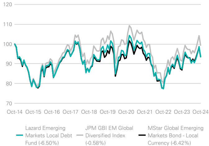
Source: Morningstar, Cumulative Growth, NAV to NAV Price, Net of fees, Net Income Reinvested to 31 October 2024 in USD.