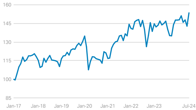
— Lazard Global Listed Infrastructure Equity Fund (53.45%)

Source: Morningstar, Cumulative Growth, NAV to NAV Price, Net of fees, Net Income Reinvested to 31 July 2024 in CHF.